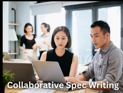
Collaborative Spec Writing

QPBUDDY remote site supervision, simplified