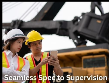
Seamless Spec to Supervision

Registration Link: https://inpqs.system.sg/webinar